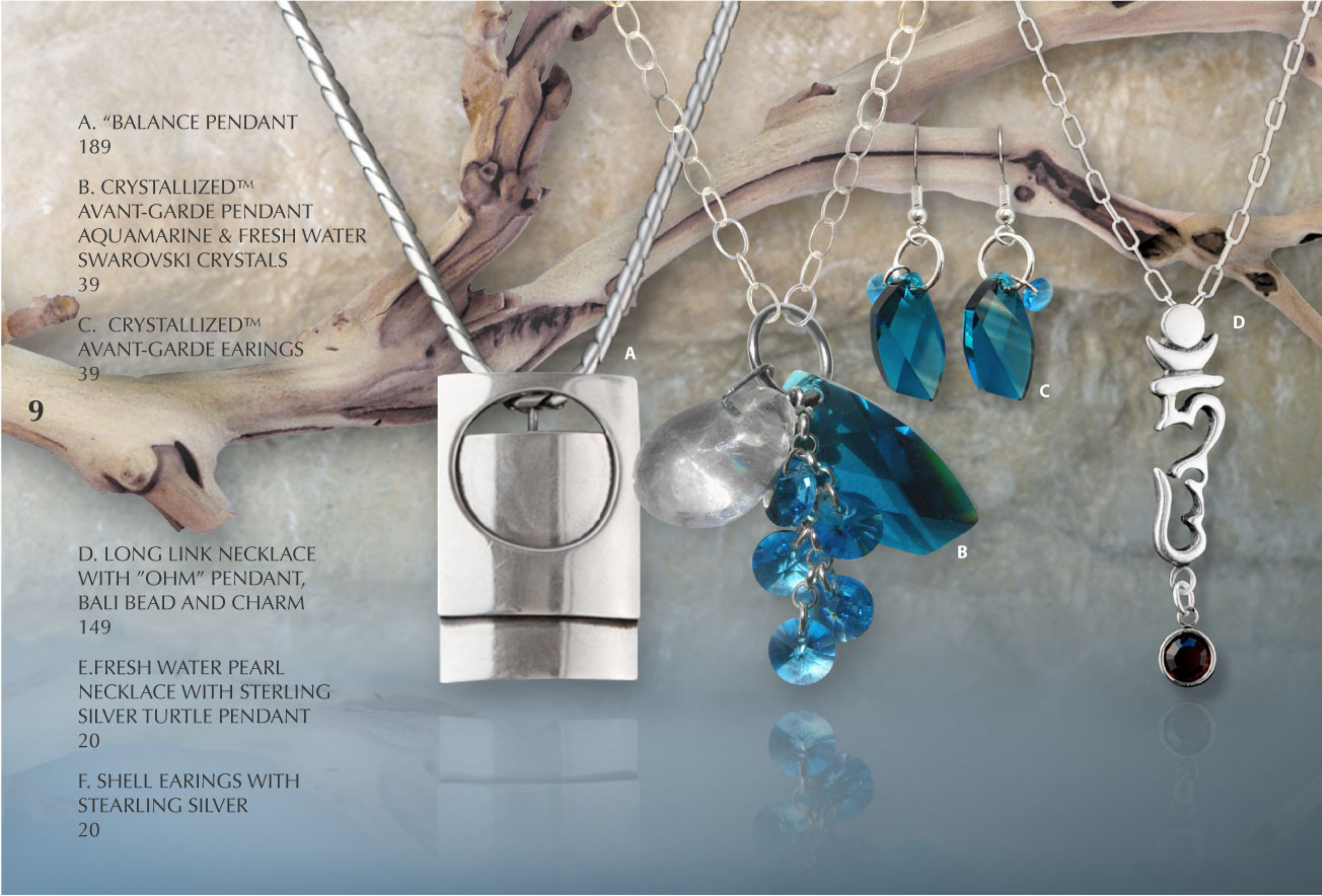
A. "BALANCE PENDANT 189